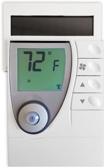
Mx-RPW Wireless Room Controller